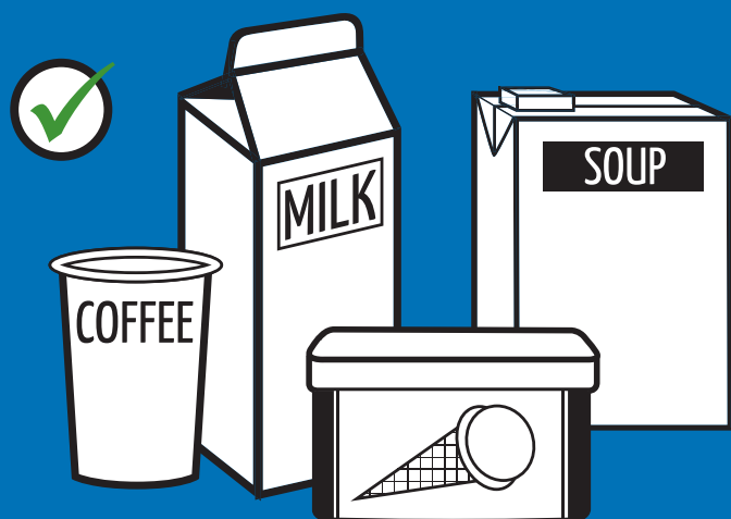
Cartons & Paper Cups