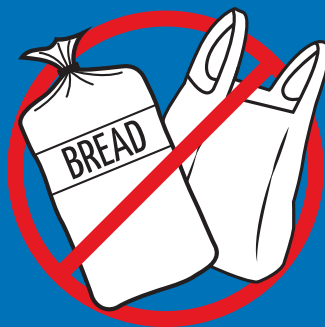
Plastic Bags & Overwrap